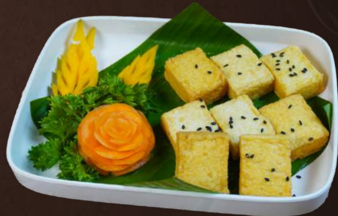
MT09 SEAFOOD TAUFU