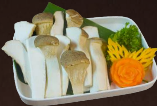
MV02 KING OYSTER MUSHROOM RM 5.50