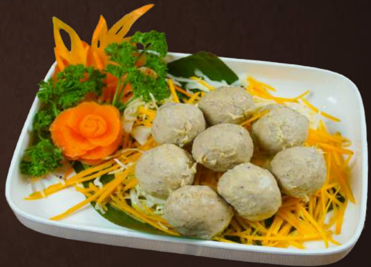
MM03 PORK BALLS RM 8.90