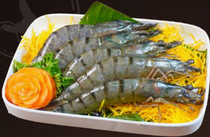
MT01 TIGER PRAWNS