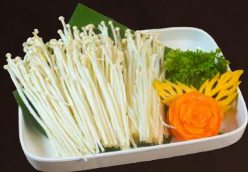
MV01 ENOKI MUSHROOM RM 4.50