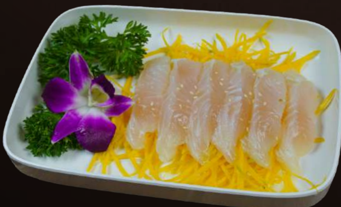
MT13 SLICED DORY FISH