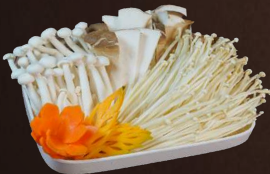
MV14 MIXED MUSHROOM RM 9.90