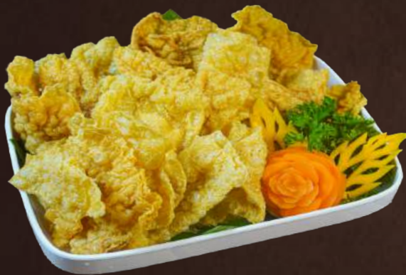
MV08 FRIED BEANCURDS RM 7.50