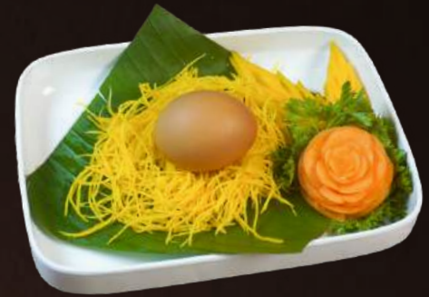
MV10 EGG RM 1.50