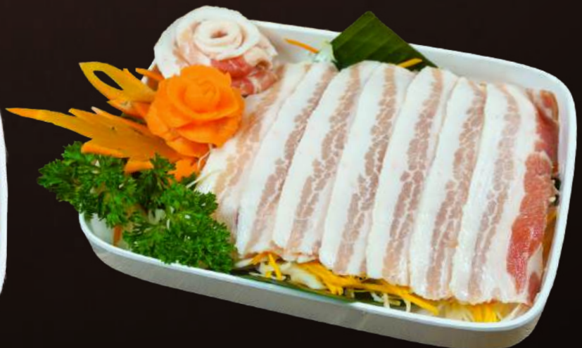
MM12 SLICED PORK BELLY RM 10.90