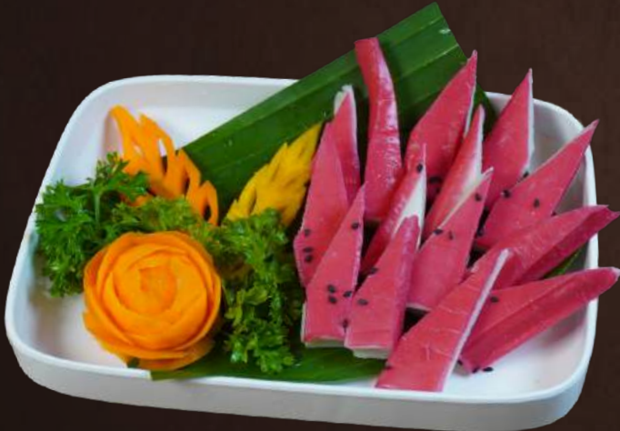
MT08 CRAB STICKS