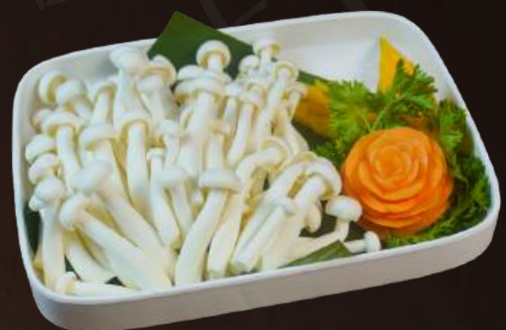
MV13 SHIMEJI RM 6.90