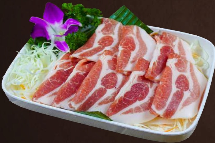
MM01 SLICED PORK SHOULDER RM 13.90