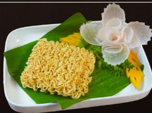
MN02 MAMA NOODLE RM 3.50