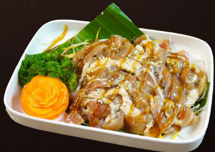
MM10 MARINATED BLACK PEPPER PORK CHOP RM 9.90