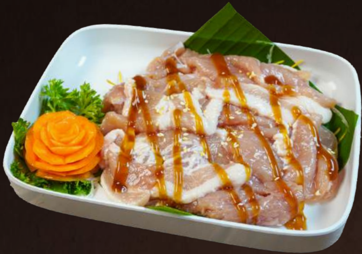
MM02 MARINATED PORK CHOP RM 9.90