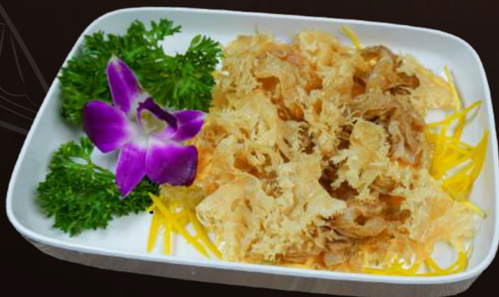
MT11 JELLY FISH