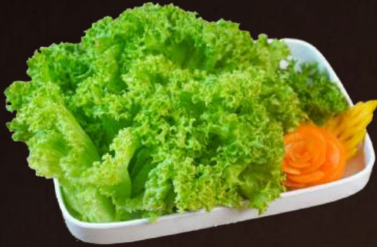
MV11 LETTUCE RM 5.00