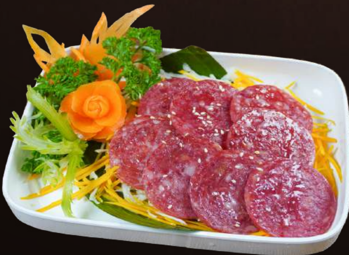
MM11 BAK KWA RM 8.90