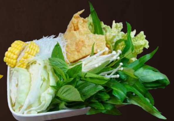
MV04 ROUND CABBAGE RM 4.00