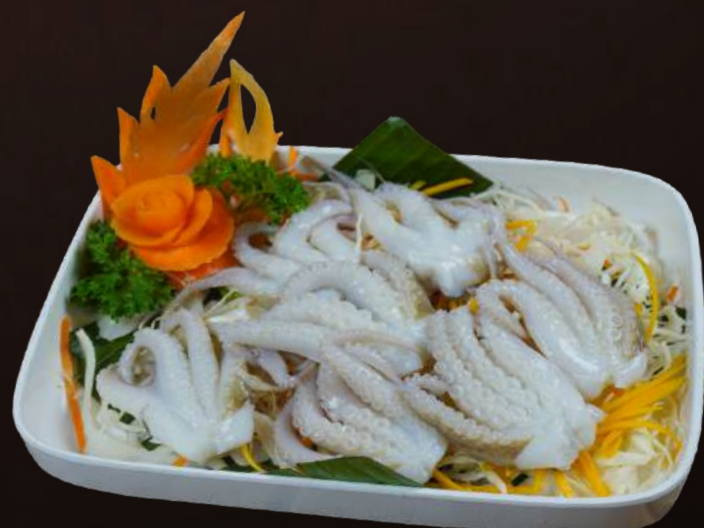
MT14 SQUID TENTACLES