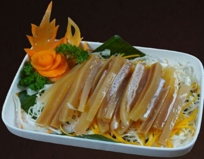
MT03 BROWN CUTTLEFISH