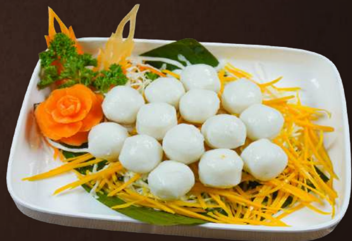
MT06 FISH BALLS