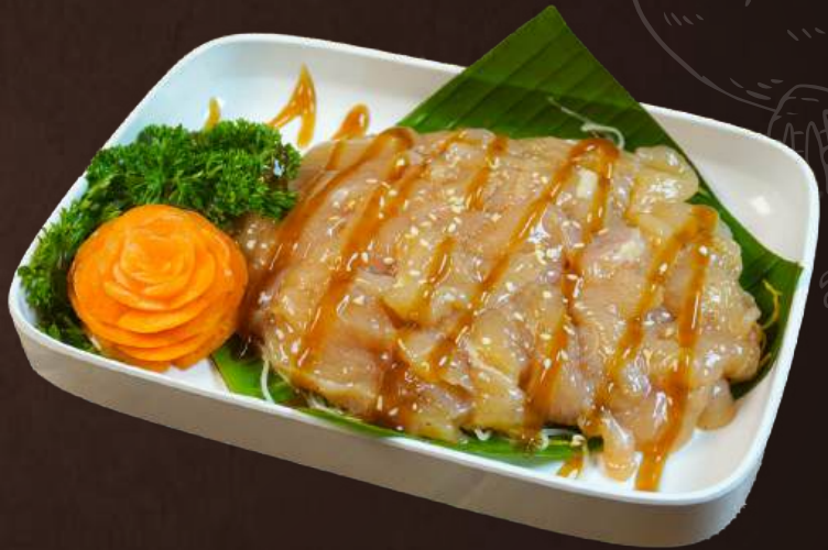
MM05 MARINATED CHICKEN CHOP RM 8.90