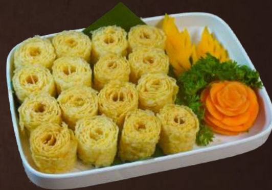
MV12 FRIED BEANCURD ROLLS RM 7.90