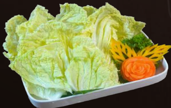
MV05 CHINESE CABBAGE RM 4.00