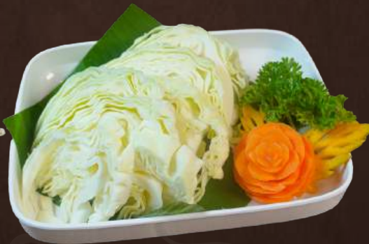
MV03 MIXED VEGETABLES RM 7.90