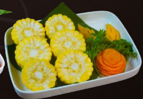
MV07 SWEET CORN RM 4.50