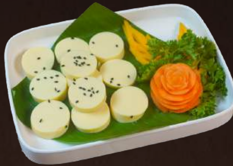
MV09 EGG TOFU RM 4.00