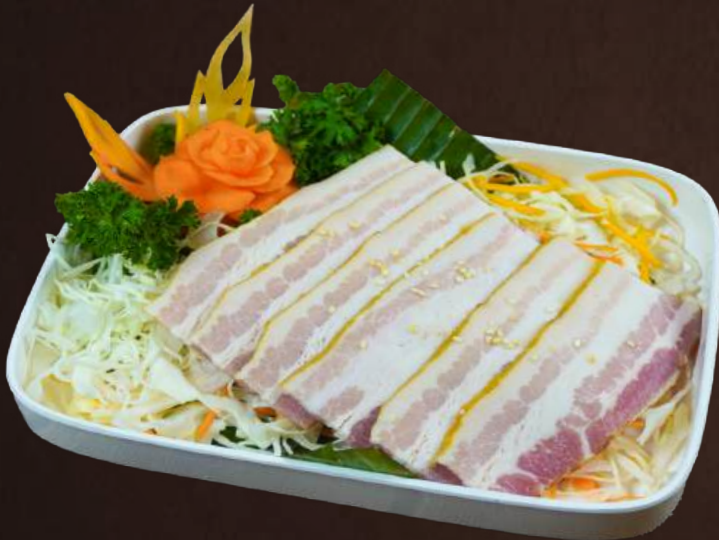
MM04 SLICED BACON RM 13.90