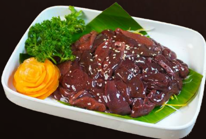
MM09 PORK LIVER RM 6.90