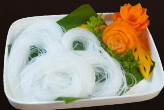
MN01 GLASS NOODLE RM 5.50