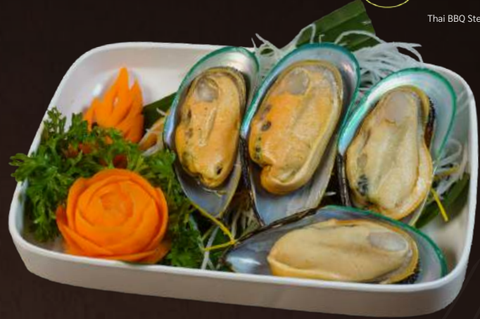
MT04 GREEN MUSSEL