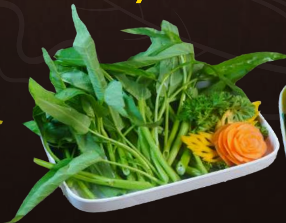
MV06 KANGKUNG RM 4.00